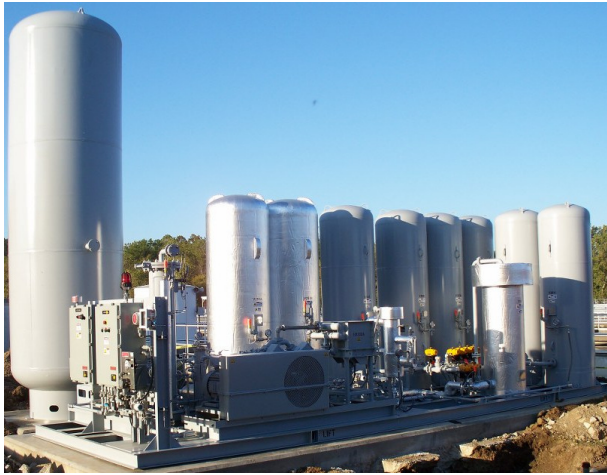
Biogas compression and clean-up unit for 100 SCFM

The Molecular Gate Technology offered by Guild Associates has been provided for over 35 projects with pipeline quality gas for pipeline, CNG and LNG produced. Since 2011 a small scale “MicroGate” system has been in operation in upgrading wastewater digester gas to high purity methane. The MicroGate design is a standard design with the feed compression and gas purification equipment mounted on a skid ready for easy installation and deployment.