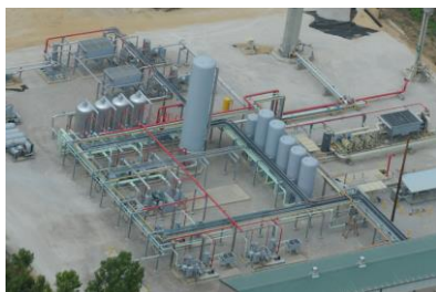
Clean Energy Site – Millington, TN

A high-BTU landfill gas project is operating to provide pipeline gas from the Republic Services North Shelby Landfill in Millington, Tenn. The upgrading system is owned and operated by Clean Energy Renewable Fuels (CERF) and the product gas is injected into the natural gas grid and used as pipeline gas and as vehicle fuel.