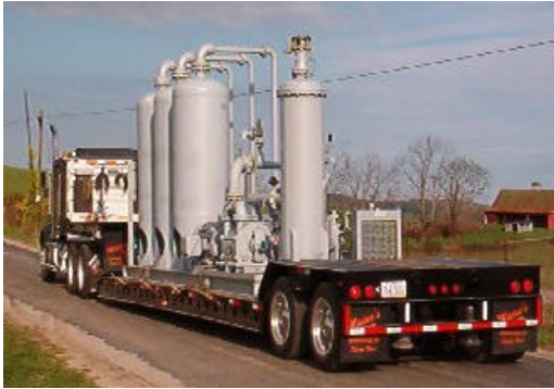
Molecular Gate ® "SPEC Plant" Being Delivered

Molecular Gate ™ adsorption systems for upgrading contaminated natural gas are rapidly growing in popularity with two-dozen projects underway. This includes systems for the removal of nitrogen (N 2 ) from natural gas, the removal of carbon dioxide (CO 2 ), or removal of a mixture of N 2 and CO 2 . Molecular Gate ® adsorbents are a new type of molecular sieve that can adsorb and remove N 2 (as well as CO 2 ) from contaminated natural gas.